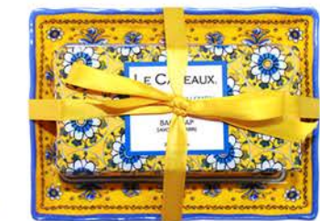
#CCGS-SD-FSL french milled bar soap on a matching melamine soap dish