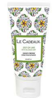
#CC-212ZOL hand cream 2 fl oz / 60 ml