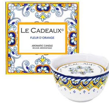
#CC-198FLO 8 oz candle in gift box

Delicate and romantic, our Fleur D'Orange scent captures the sweet floral fragrance of the orange blossom before it is picked from the tree