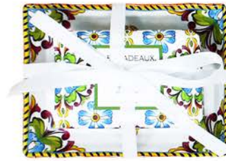
#CCGS-SD-FG french milled bar soap on a matching melamine soap dish