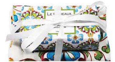
#CC-BSTT-FG kitchen bar soap with tea towel