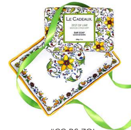
#CC-BS-ZOL french milled bar soap 7 oz / 200 gm #CC-295CAPR small tray / soap dish 5.75" x 4.25"