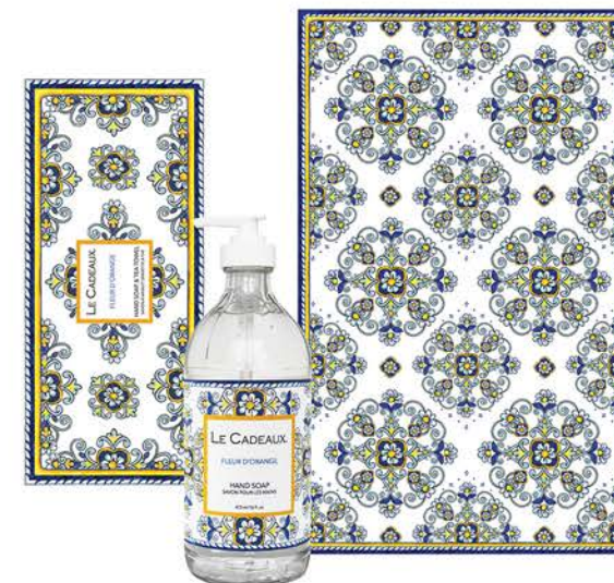
#CCGS-GBS-FLO liquid hand wash and matching tea towel in a decorative gift box