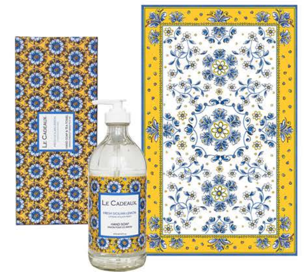
#CCGS-GBS-FSL liquid hand wash and matching tea towel in a decorative gift box