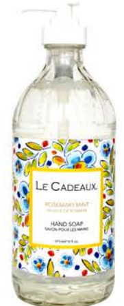
#CC-BHS-RM liquid hand wash in a decorative glass bottle 16 fl oz / 473 ml