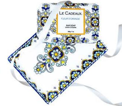
#CC-BS-FLO french milled bar soap 7 oz / 200 gm #CC-295SOR small tray / soap dish 5.75" x 4.25"