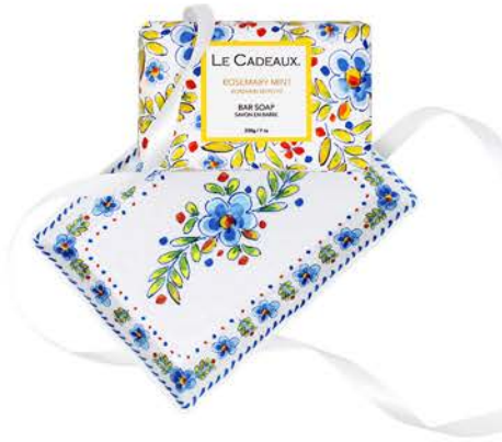
#CC-BS-RM french milled bar soap 7 oz / 200 gm