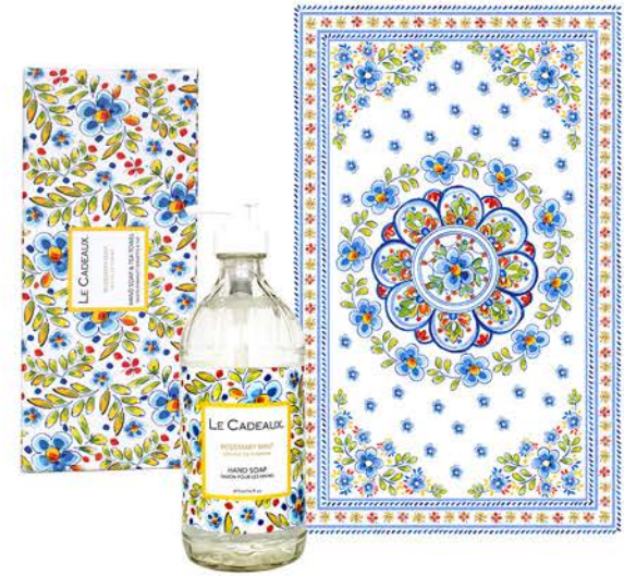
#CCGS-GBS-RM liquid hand wash and matching tea towel in a decorative gift box