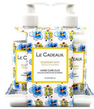
#CC-DUO-RM liquid hand wash and hand cream in 8 oz bottles with matching melamine dish