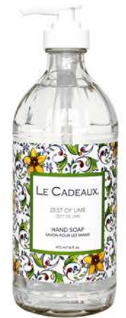
#CC-BHS-ZOL liquid hand wash in a decorative glass bottle 16 fl oz / 473 ml