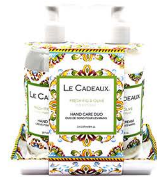
#CC-DUO-FG liquid hand wash and hand cream in 8 oz bottles with matching melamine dish