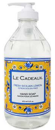
#CC-BHS-FSL liquid hand wash in a decorative glass bottle 16 fl oz / 473 ml