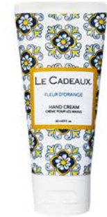
#CC-212FLO hand cream 2 fl oz / 60 ml