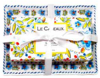
#CCGS-SD-RM french milled bar soap on a matching melamine soap dish