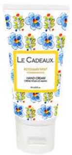
#CC-212RM hand cream 2 fl oz / 60 ml