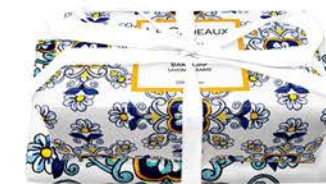
#CCGS-BSTT-SOR kitchen bar soap with tea towel