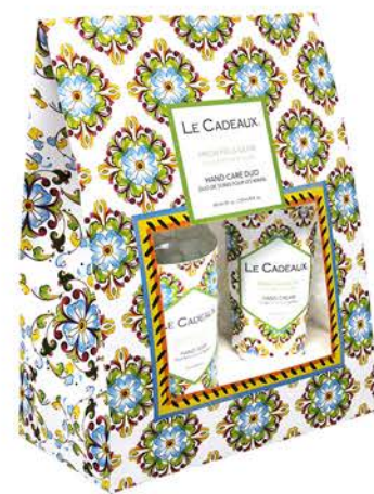
#CCGS-HSHC-FG 8 oz liquid hand wash and 2 oz hand cream in decorative gift bag