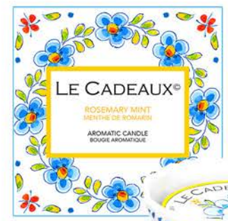
#CC-198RM 8 oz candle in gift box

A uniquely modern blend of fresh garden mint and savory rosemary that will stimulate your senses and invite relaxation