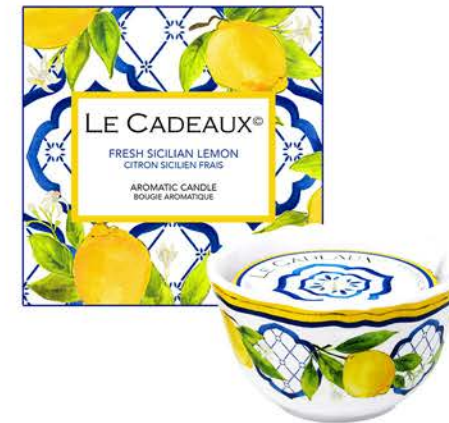
#CC-198FSL 8 oz candle in gift box

The sunny notes in this fresh and clean fragrance evoke a summer day spent under lemon trees in the orchards of Sicily