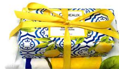
#CCGS-BSTT-PAL kitchen bar soap with lemon basil vinaigrette recipe tea towel