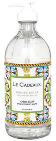
#CC-BHS-FG liquid hand wash in a decorative glass bottle 16 fl oz / 473 ml