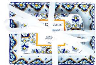
#CCGS-SD-FLO french milled bar soap on a matching melamine soap dish