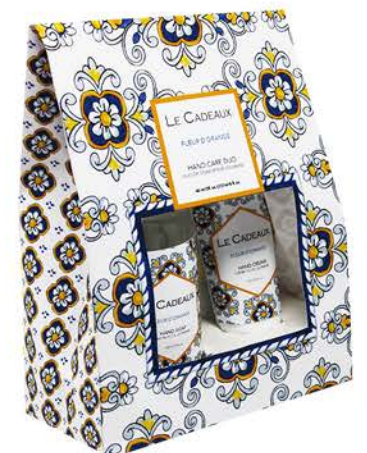
#CCGS-HSHC-SOR 8 oz liquid hand wash and 2 oz hand cream in decorative gift bag