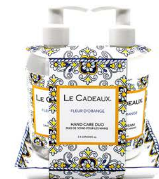
#CC-DUO-FLO liquid hand wash and hand cream in 8 oz bottles with matching melamine dish