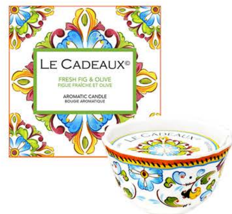
#CC-198FG 8 oz candle in gift box

This delicate fragrance blends notes of Mediterranean fig and soft olive blossom creating a warm and pleasing scent that adds a touch of luxury to your day