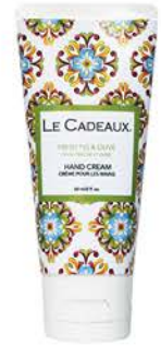
#CC-212FG hand cream 2 fl oz / 60 ml