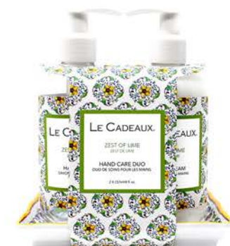
#CC-DUO-ZOL liquid hand wash and hand cream in 8 oz bottles with matching melamine dish