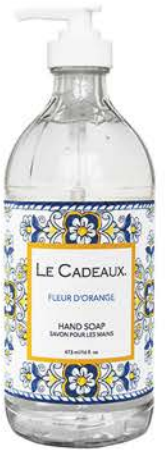
#CC-BHS-FLO liquid hand wash in a decorative glass bottle 16 fl oz / 473 ml