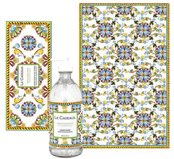
#CCGS-GBS-FG liquid hand wash and matching tea towel in a decorative gift box