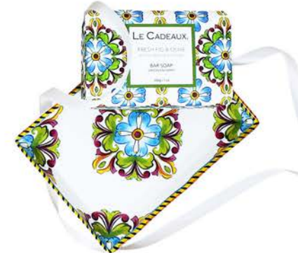
#CC-BS-FG french milled bar soap 7 oz / 200 gm