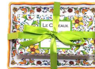
#CCGS-SD-ZOL french milled bar soap on a matching melamine soap dish