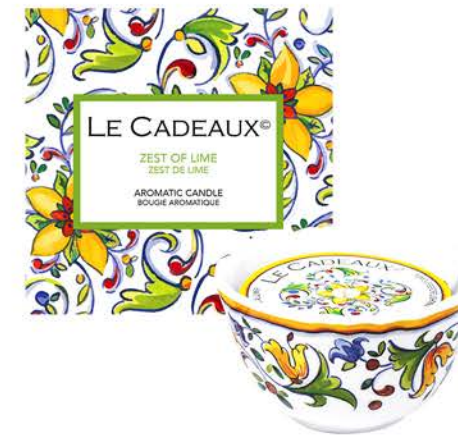
#CC-198ZOL 8 oz candle in gift box

The crisp, fresh citrus notes in zest of lime create an invigorating fragrance that will infuse your day with a touch of the unexpected