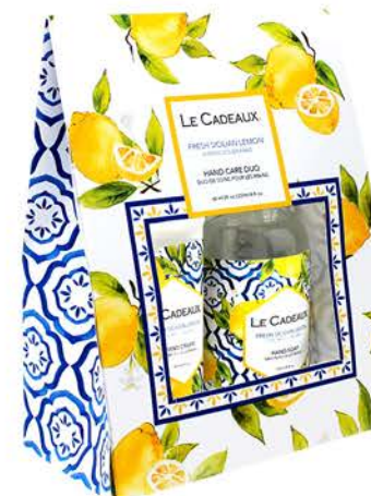
#CCGS-HSHC-PAL 8 oz liquid hand wash and 2 oz hand cream in decorative gift bag