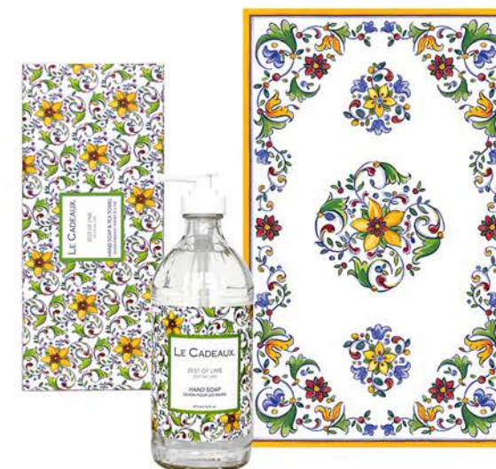
#CCGS-GBS-ZOL liquid hand wash and matching tea towel in a decorative gift box