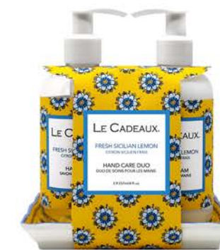
#CC-DUO-FSL liquid hand wash and hand cream in 8 oz bottles with matching melamine dish