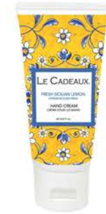
#CC-212FSL hand cream 2 fl oz / 60 ml