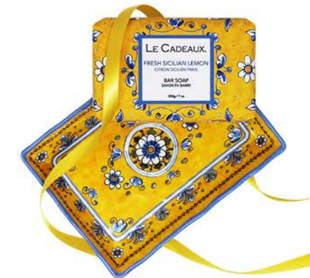
#CC-BS-FSL french milled bar soap 7 oz / 200 gm