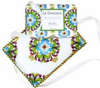
#CC-BS-FG french milled bar soap 7 oz / 200 gm