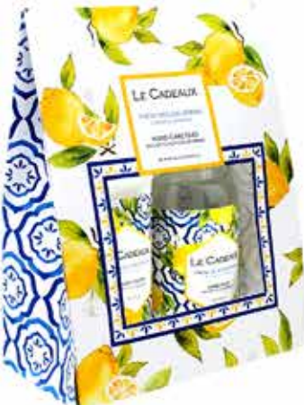
#CCGS-HSHC-PAL 8 oz liquid hand wash and 2 oz hand cream in decorative gift bag