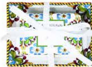
#CCGS-SD-FG french milled bar soap on a matching melamine soap dish