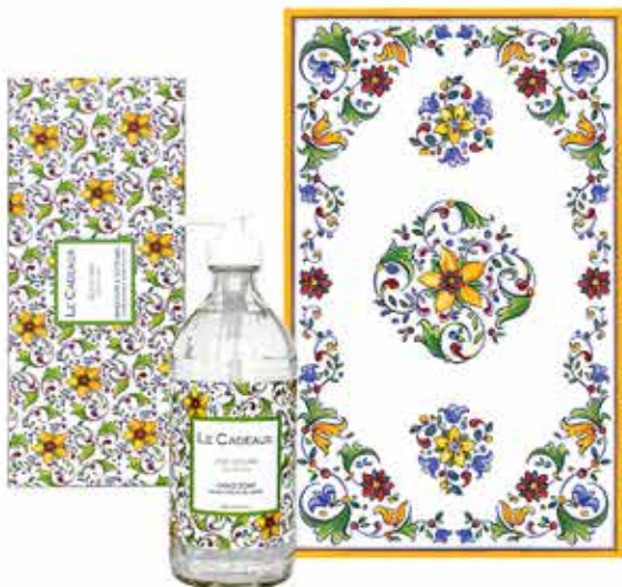
#CCGS-GBS-ZOL liquid hand wash and matching tea towel in a decorative gift box