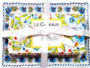
#CCGS-SD-RM french milled bar soap on a matching melamine soap dish