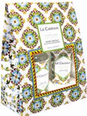
#CCGS-HSHC-FG 8 oz liquid hand wash and 2 oz hand cream in decorative gift bag