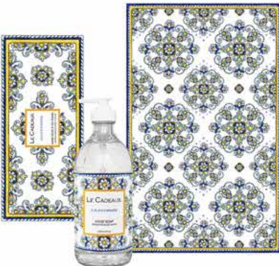
#CCGS-GBS-FLO liquid hand wash and matching tea towel in a decorative gift box