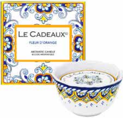
#CC-198FLO 8 oz candle in gift box

Delicate and romantic, our Fleur D'Orange scent captures the sweet floral fragrance of the orange blossom before it is picked from the tree