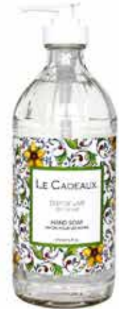
#CC-BHS-ZOL liquid hand wash in a decorative glass bottle 16 fl oz / 473 ml

The crisp, fresh citrus notes in zest of lime create an invigorating fragrance that will infuse your day with a touch of the unexpected