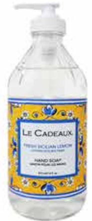
#CC-BHS-FSL liquid hand wash in a decorative glass bottle 16 fl oz / 473 ml