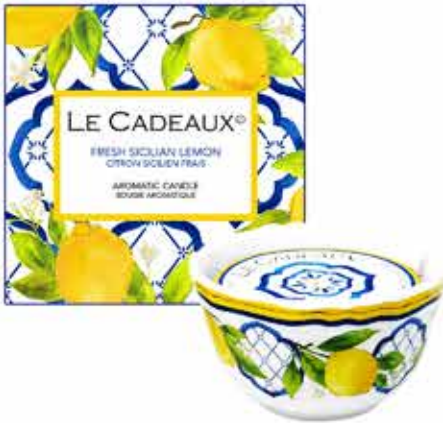
#CC-198FSL 8 oz candle in gift box