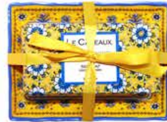
#CCGS-SD-FSL french milled bar soap on a matching melamine soap dish