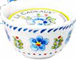
#CC-198RM 8 oz candle in gift box