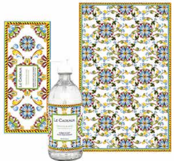
#CCGS-GBS-FG liquid hand wash and matching tea towel in a decorative gift box