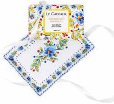
#CC-BS-RM french milled bar soap 7 oz / 200 gm