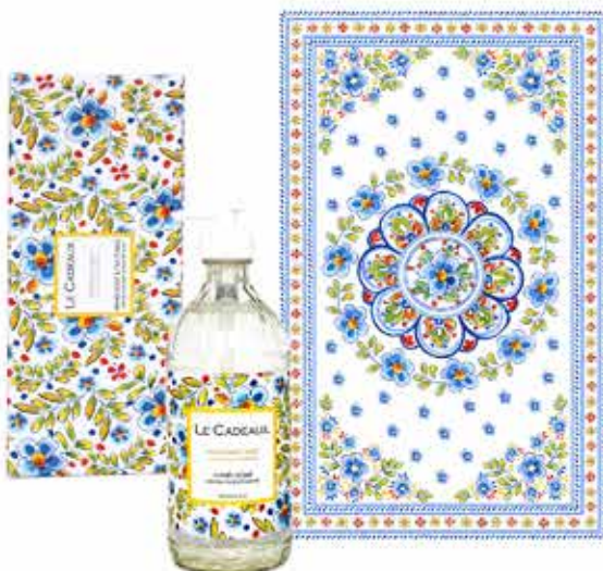
#CCGS-GBS-RM liquid hand wash and matching tea towel in a decorative gift box