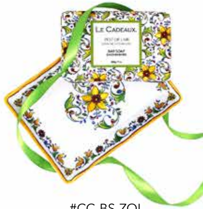
#CC-BS-ZOL french milled bar soap 7 oz / 200 gm