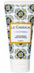
#CC-212FLO hand cream 2 fl oz / 60 ml