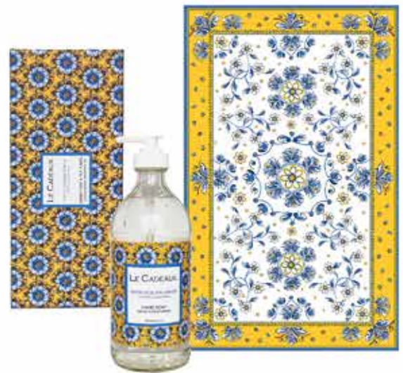
#CCGS-GBS-FSL liquid hand wash and matching tea towel in a decorative gift box