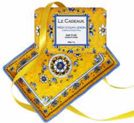
#CC-BS-FSL french milled bar soap 7 oz / 200 gm