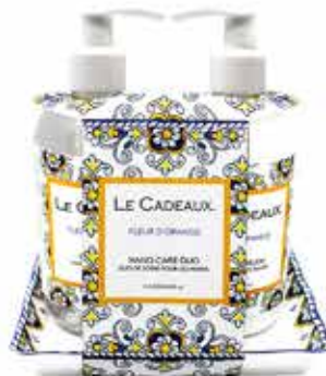
#CC-DUO-FLO liquid hand wash and hand cream in 8 oz bottles with matching melamine dish