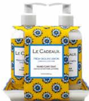
#CC-DUO-FSL liquid hand wash and hand cream in 8 oz bottles with matching melamine dish