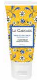
#CC-212FSL hand cream 2 fl oz / 60 ml

The sunny notes in this fresh and clean fragrance evoke a summer day spent under lemon trees in the orchards of Sicily