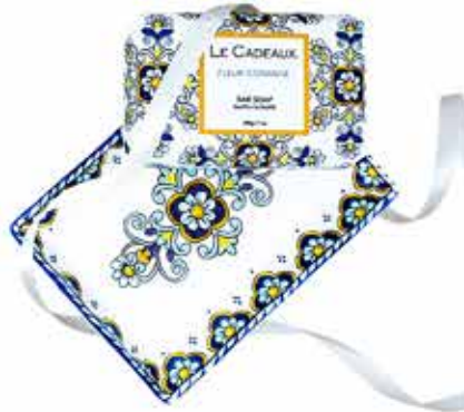
#CC-BS-FLO french milled bar soap 7 oz / 200 gm