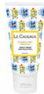
#CC-212RM hand cream 2 fl oz / 60 ml