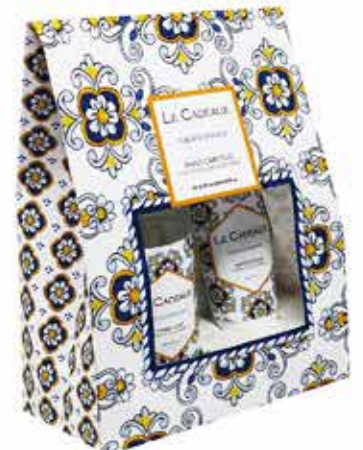
#CCGS-HSHC-SOR 8 oz liquid hand wash and 2 oz hand cream in decorative gift bag