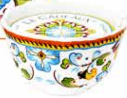
#CC-198FG 8 oz candle in gift box