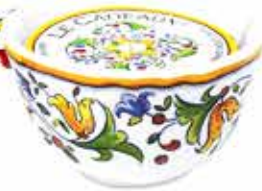
#CC-198ZOL 8 oz candle in gift box