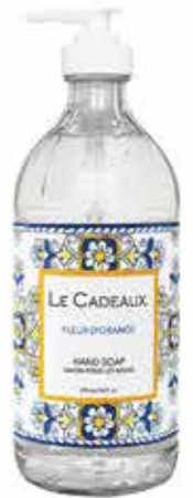
#CC-BHS-FLO liquid hand wash in a decorative glass bottle 16 fl oz / 473 ml