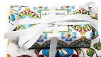
#CC-BSTT-FG kitchen bar soap with tea towel