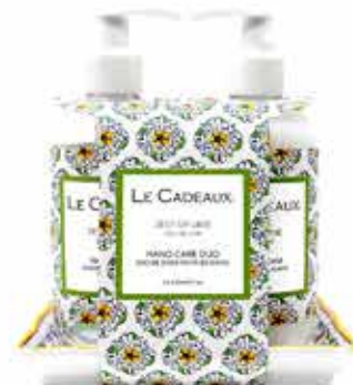
#CC-DUO-ZOL liquid hand wash and hand cream in 8 oz bottles with matching melamine dish