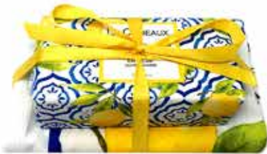
#CCGS-BSTT-PAL kitchen bar soap with lemon basil vinaigrette recipe tea towel