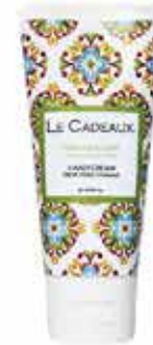
#CC-212FG hand cream 2 fl oz / 60 ml

This delicate fragrance blends notes of Mediterranean fig and soft olive blossom creating a warm and pleasing scent that adds a touch of luxury to your day