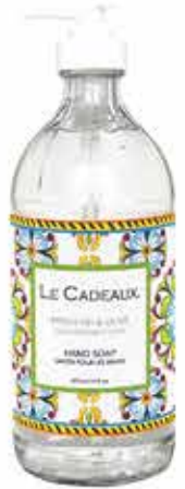
#CC-BHS-FG liquid hand wash in a decorative glass bottle 16 fl oz / 473 ml