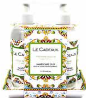
#CC-DUO-FG liquid hand wash and hand cream in 8 oz bottles with matching melamine dish