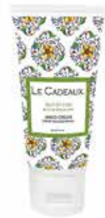
#CC-212ZOL hand cream 2 fl oz / 60 ml