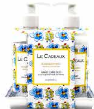
#CC-DUO-RM liquid hand wash and hand cream in 8 oz bottles with matching melamine dish