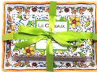
#CCGS-SD-ZOL french milled bar soap on a matching melamine soap dish