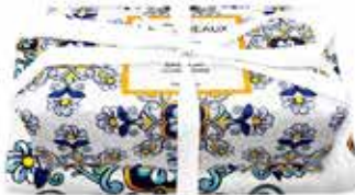
#CCGS-BSTT-SOR kitchen bar soap with tea towel