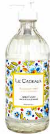
#CC-BHS-RM liquid hand wash in a decorative glass bottle 16 fl oz / 473 ml

A uniquely modern blend of fresh garden mint and savory rosemary that will stimulate your senses and invite relaxation